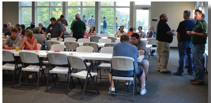
Everyone enjoyed the conversation and meal at Butler County REC's contractor appreciation event held in September.