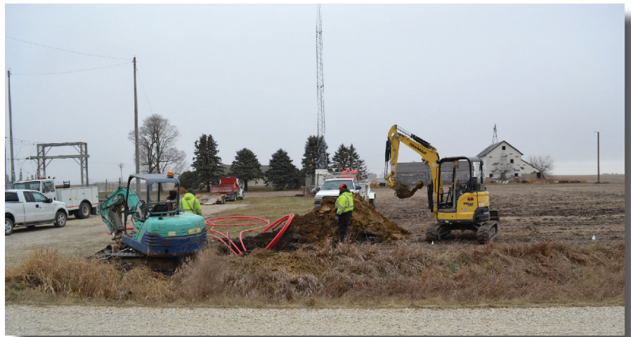
Trenchers begin work for Butler County REC's new solar array, Solar II, located north of the town of Bremer.

Installed by Midland Development Corp., a division of Western Iowa Power Cooperative, Solar II is scheduled to be operational by April 1.