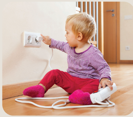
If you have young children, plug wall outlets with child-safety caps.

Start with a self-audit of your home—something you should turn into an annual ritual. Check that all of your appliances are still in working order by turning them on and off, listening to the sound of the motor (is it “normal”?) and inspecting their cords and plugs for damage.