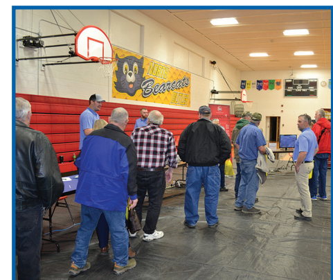
Members discussing energy efficiency with Butler County REC employees.