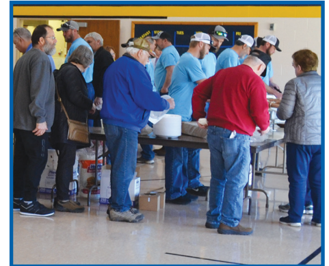
Members in line to receive their annual meeting meal.