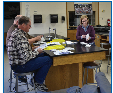
Tellers counting the mail-in ballots for the director election.